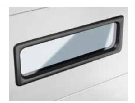
Dimensions 588 x 181 mm /