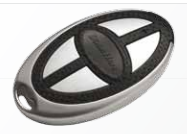
Remote control /

Remote controls, photocells, external receivers, keyboards and other automation accessories, allow a convenient and a safe door operation. All control devices are optimized to connect with DoorHan automation systems, but they can also be combined with devices from other manufacturers. Remote controls are easy to program, within a few key presses, which saves time and provides a safe and easy operation of all automation systems.