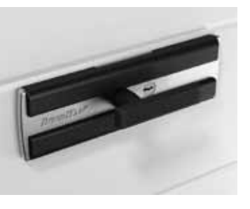
Lock for RSD01, RSD02

Mechanical locks automatically block the door leaf after closing. Locks for RSD01 series and RSD02 series have a unique design and a robust construction.