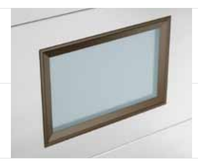
Dimensions 452 x 322 mm /