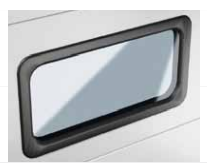
Dimensions 638 x 338 mm /